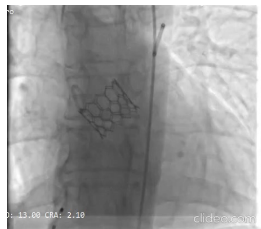
Figure 2: Fluoroscopic image shows the optimal deployment of the Myval THV