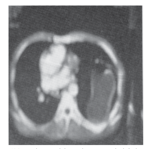
Figure 2: CT scan showing abdominal content in the left chest

Contrast CT scan showed rupture of diaphragm on left side and transaction descending aorta below the original left subclavin artery.. then he was referred to SGNHC.